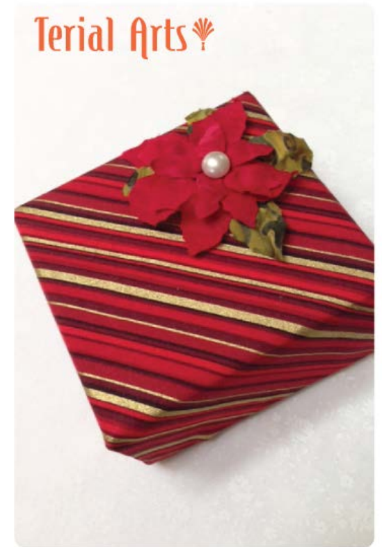
Easy Fabric Giftwrapping! This box will be treasured! Mini fabric Poinsettia bow from our Poinsettia pattern