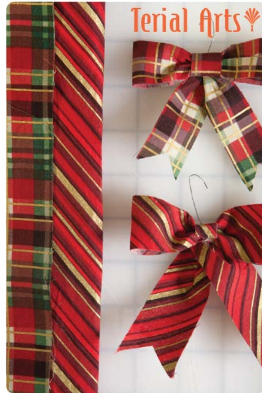
Fun fabric decorations and bows~