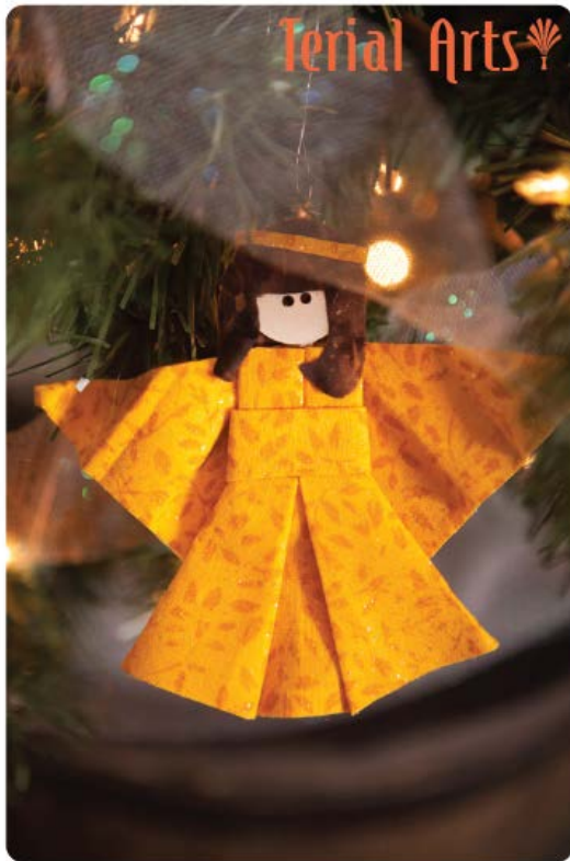
Terrial Magic treated fabric folds like paper to make fun origami angels