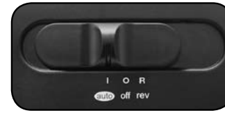
▲ Power switch in auto position

Use thick paper stock or greeting card to push the jam through ►