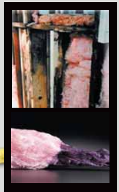
Fiberglass, when wet and compressed, loses a significant portion of its insulative value and over time could serve as a catalyst for mold, mildew and other unwanted bacteria.