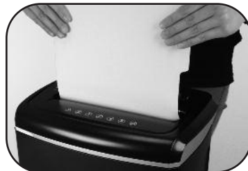
◀ Use thick paper stock or greeting card to push the jam through