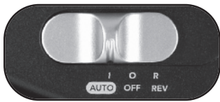
▲ Power switch in auto position

b) With stubborn situations where the reverse function does not help, you may loosen the jammed paper with shredder oil (cooking oil is acceptable, nothing aerosol). Start by drizzling oil into the blades where the paper is jammed. Let it soak for about 30 minutes to completely saturate. Return the shredder back to Auto-On mode. If required, a rigid sheet of cardstock (old greeting card, folded file folder, or a sheet torn from a cereal box) can be fed into the shredder to help push the jammed paper through.